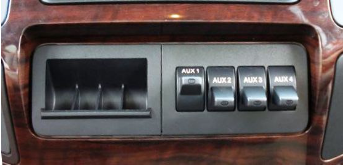
Finished installation of Upfitter Switches without Trailer Brake Controller (Coin Slot)